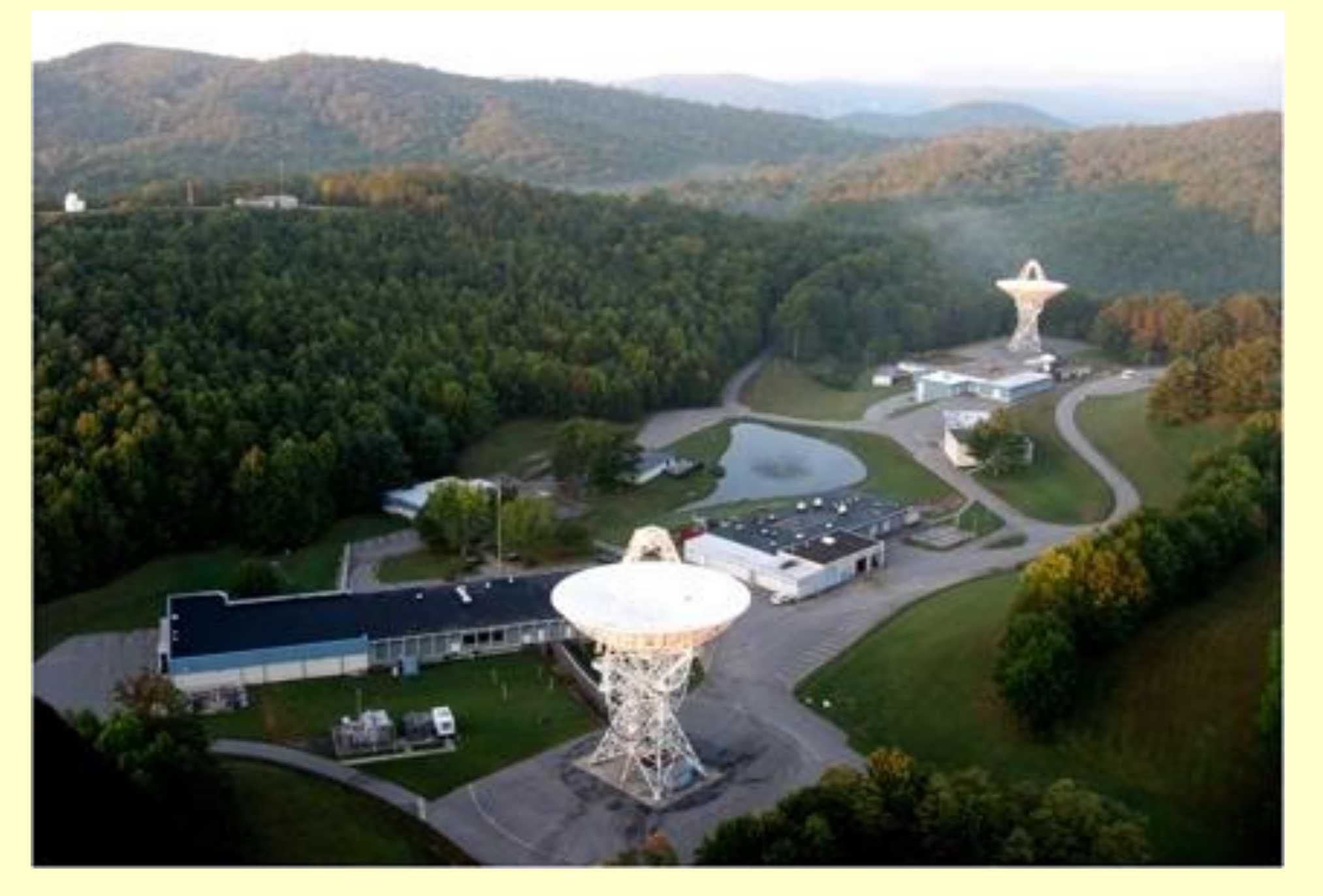
The 80 hectare Pisgah Astronomical Research Institute (PARI), Showing the 26m East and 26m West radio telescopes.